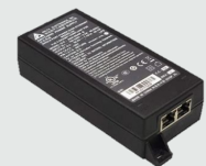
Poly PoE++ 65W Adapter For customers without PoE++ available in meeting rooms

Smart center-of-table 360° view companion camera that works seamlessly with Poly Studio X32 automatically deliver the best angle of meeting participants. (pending availability)