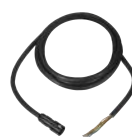
WV-QCA502 I/O Cable for Aero PTZ camera