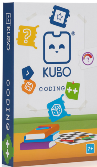
Product view with closed box