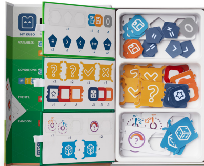
Product view with open box