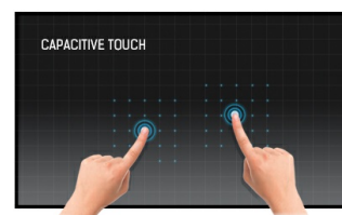
Touch technology - Capacitive

Thanks to Android OS, you can easily customize the display to your needs by installing applications directly to it.