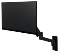
LX Pro Wall Monitor Arm