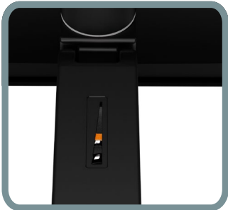
NEW TENSION INDICATOR SET TENSION LEVEL ONCE AND REPEAT FOR QUICK INSTALLATION OF MULTIPLE WORKSTATIONS