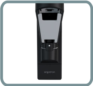
NEW ROTATION STOP PREVENT DAMAGE TO WALLS, PARTITIONS, OR CUBICLES