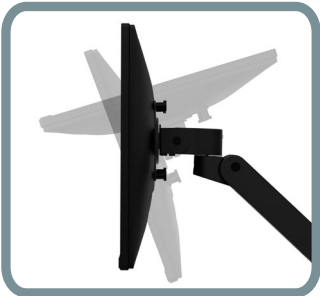
INCREASED TILT RANGE BETTER ERGONOMICS FOR USERS