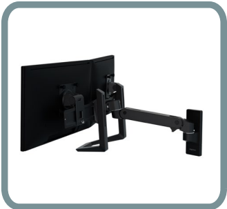
DUAL DIRECT KIT