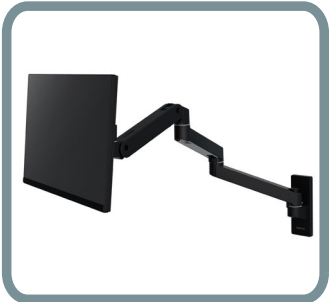
MONITOR ARM EXTENSION